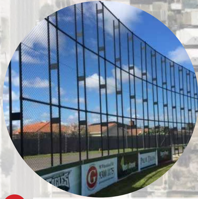
5 1.2m high chainmesh fence to oval with 6m high ball protection fence to western side