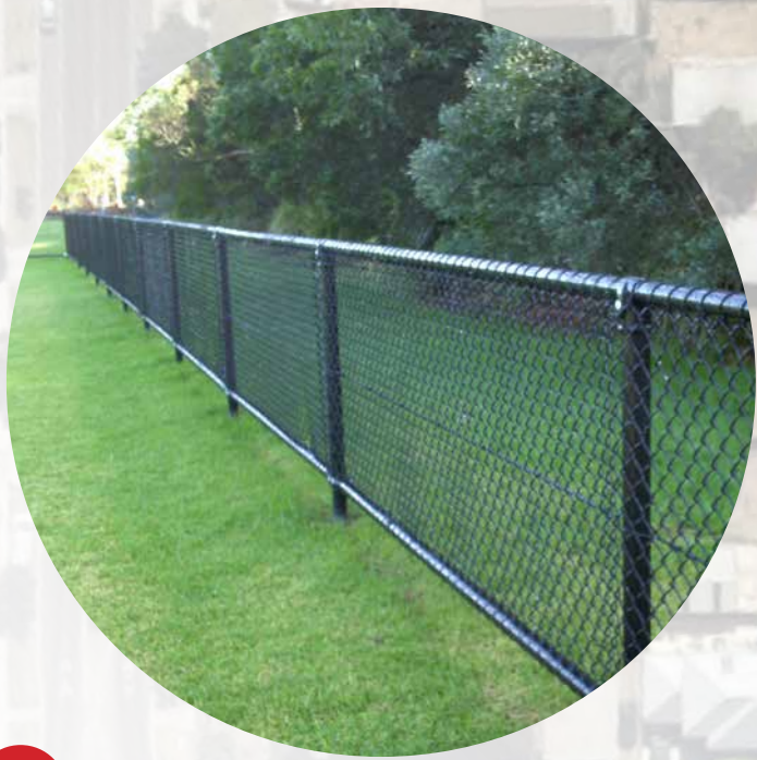
7 1.2m high boundary fence with lockable gates allowing access after school hours

Pedestrian access gate ●●● Maintenance access gate ●●●