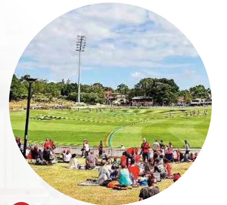
8 Example of grass embankment