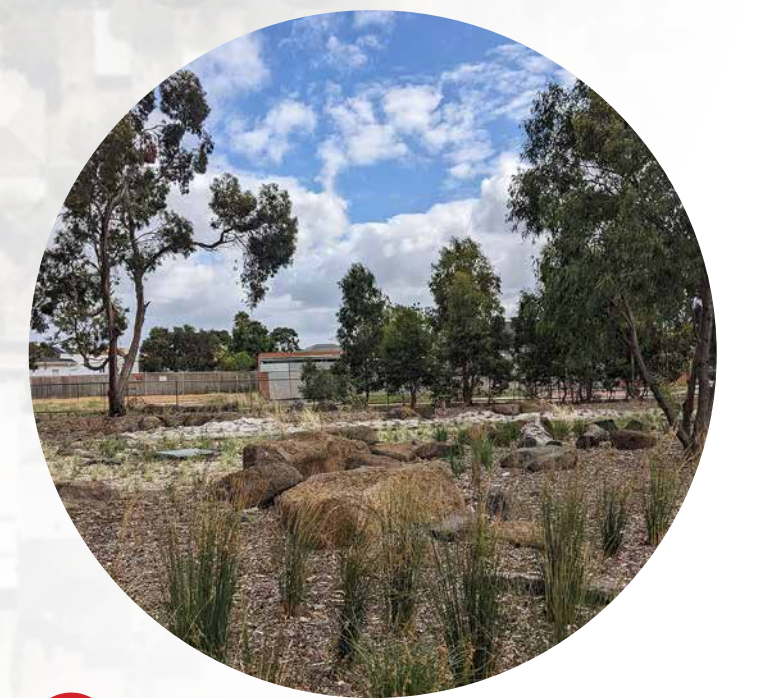
12 Existing raingarden