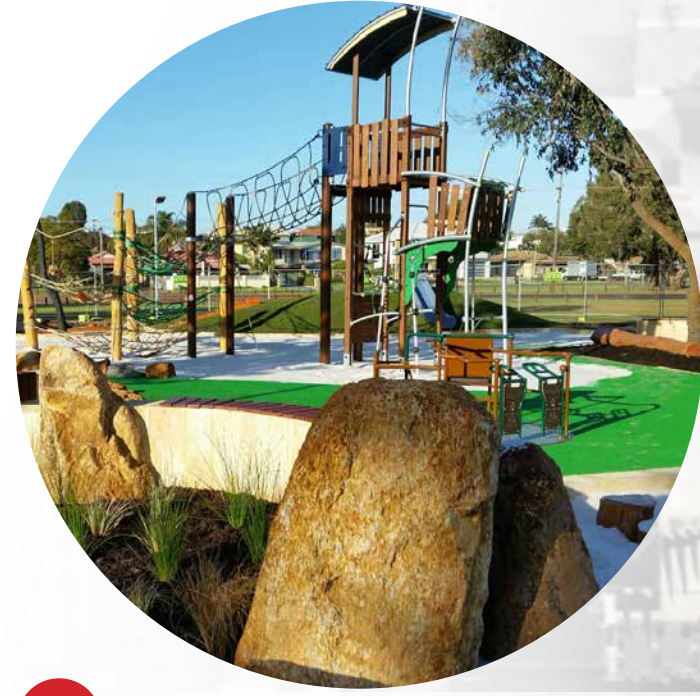
2 Example of playground / nature play area