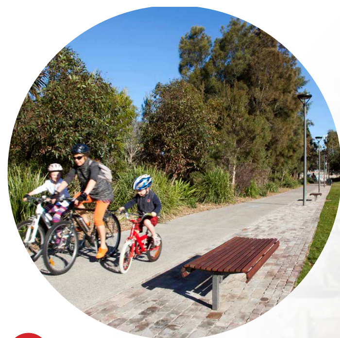
1 Example of shared use path (3m wide)