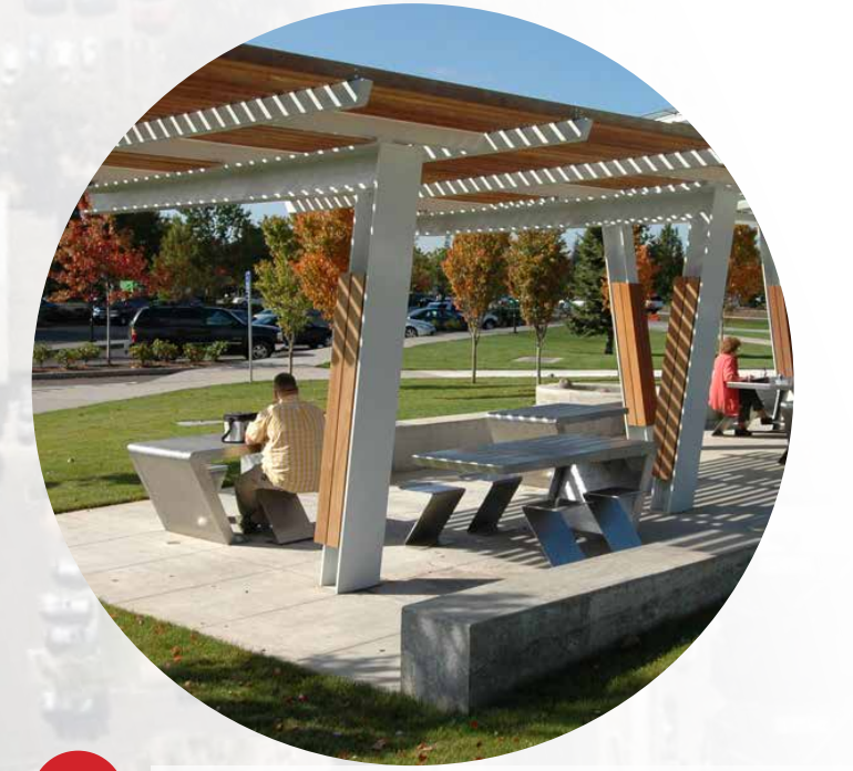
9 Example of picnic shelters with seats