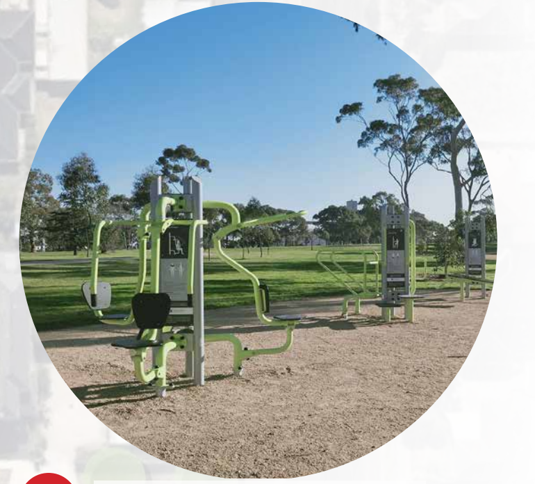
11 Example of fitness stations