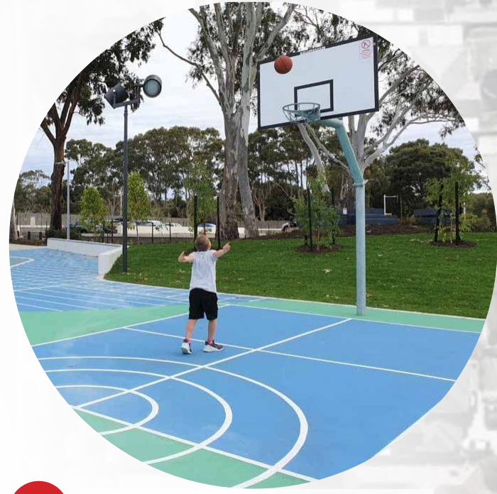
4 Example of basketball court