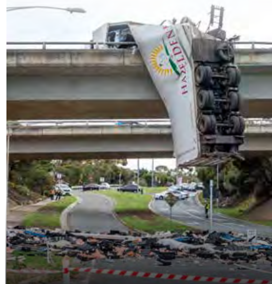
Calder Park Freeway overpass, Green Gully Road.

FROM 2015-2023 BETWEEN THE WESTERN RING ROAD AND GAP ROAD IN SUNBURY