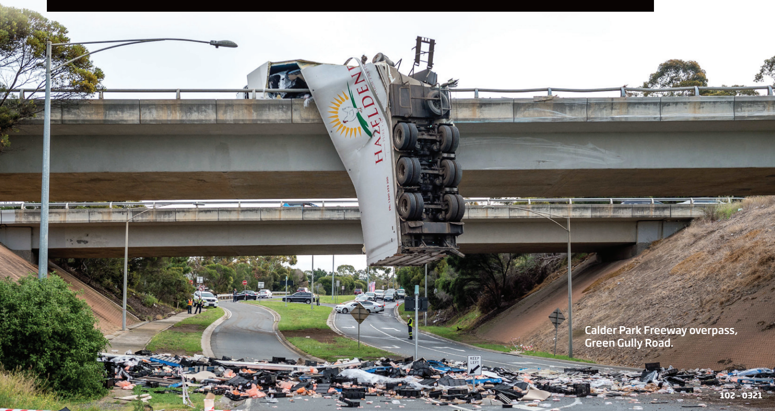
Calder Park Freeway overpass, Green Gully Road.